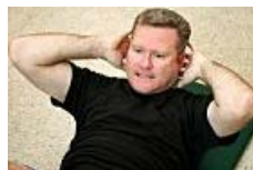
Local Man Loses Beer Belly By Stopping Ex... Hot Topix