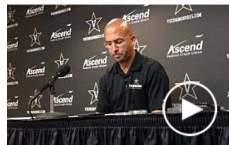
Vanderbilt coach James Franklin discusses Ole Miss