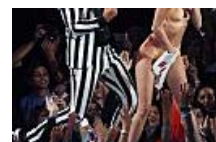
Miley Cyrus at the VMAs