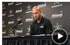
Vanderbilt coach James Franklin discusses Ole... Aug 26, 2013