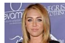
We Can't Help But Stare At Miley Cyrus StyleBistro