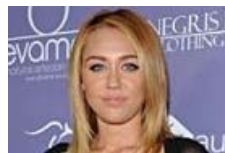
We Can't Help But Stare At Miley Cyrus StyleBistro