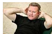
Local Man Loses Beer Belly By Stopp... Hot Topix