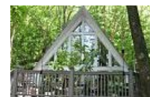
Holly Tree Gap home among the trees