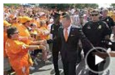
Butch Jones walks his first Vol Walk Aug 31, 2013