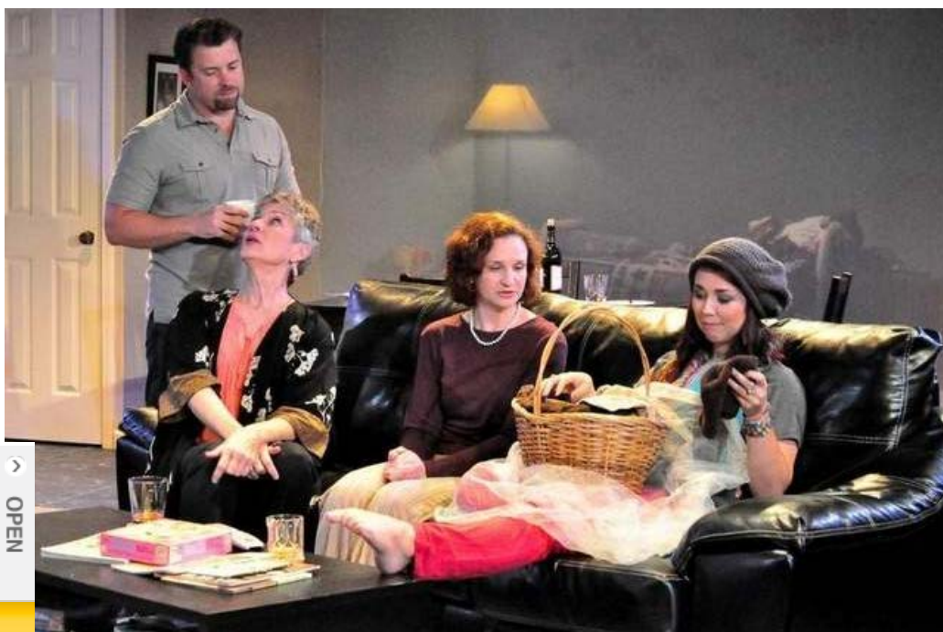
Circle Players and Lipscomb University's team up to present David Lindsay-Abaire's play 'Rabbit Hole.' The play follows a typical suburban family as it copes with tragedy.

Written by Amy Stumpfl For The Tennessean