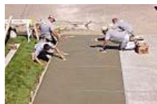
Pros and Cons of Concrete and Angie's List